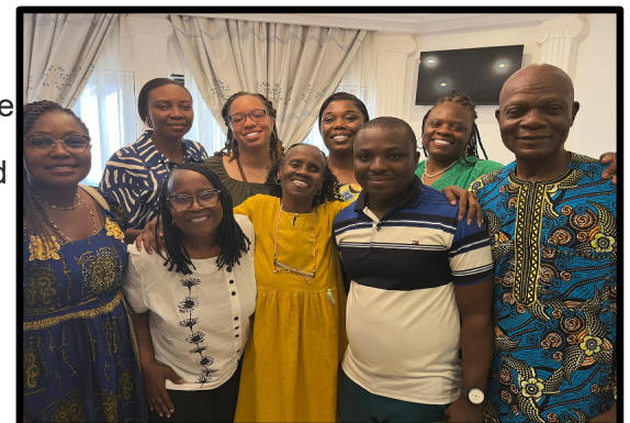
U.S. And Benin. Board Members

preaching and sharing the gospel which lead to many new decisions to accept Jesus. A blessing indeed!