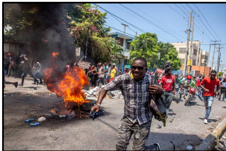
Haiti Gang Violence

My heart aches for my beloved Haiti and my family there. The violence and instability caused by the gangs are deeply concerning. They are in the process of taking over the entire country; bringing chaos, shooting, raping and killing along the way. They arrived in our neck of the woods around late May and have entered and taken over the CCWM compound. Fortunately, God has spared the lives of all my staff, the children and parents, so we are thanking God. And despite not having a physical building to occupy at the moment, we continue to build lives and look to God for our hope. Please pray with us that God will intervene and have mercy on Haiti soon.