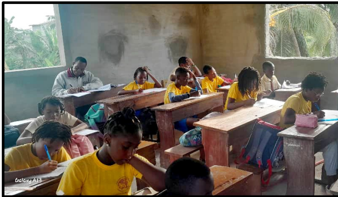
First Floor of Calavi Class Room